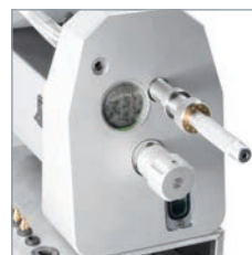
Cut the electrode by turning the handle.