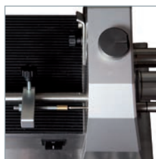
Set the cutting length.