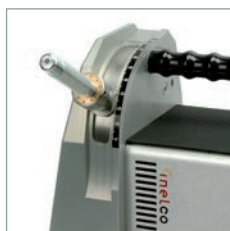
Grind the electrode in the desired angle.